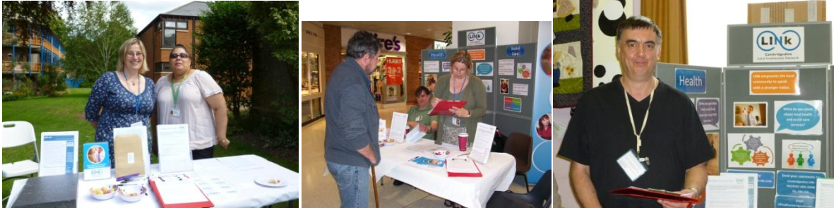
Participants and Host team staff at recent engagement events.

Cambridgeshire LINK has recently approved a new community engagement strategy for 2011/12. You can find details of the strategy on our website at http://www.cambridgeshirelink.org.uk/downloads/communityengagementstrategywithoutworkplanwebversion_110711102945.pdf .